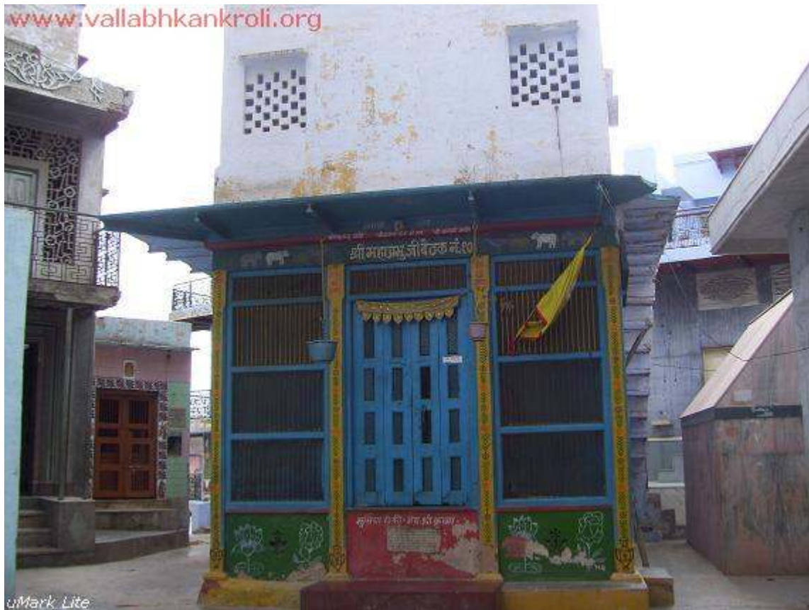
Shri Mahaprabhuji's Bethak - Mansi ganga