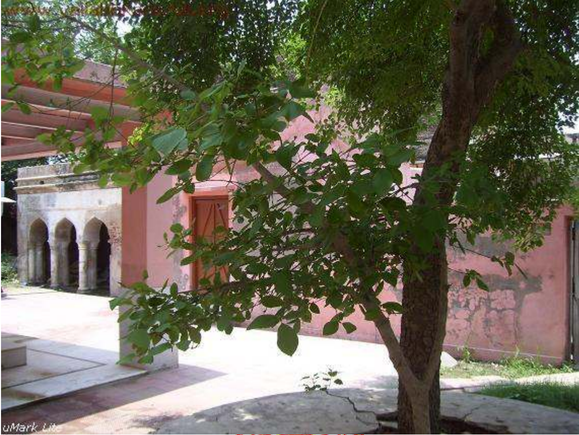
Shri Bethakji - Chandrasarovar