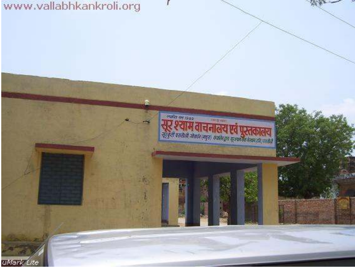
Shri Sur Vanchanalaya - Chandrasarovar