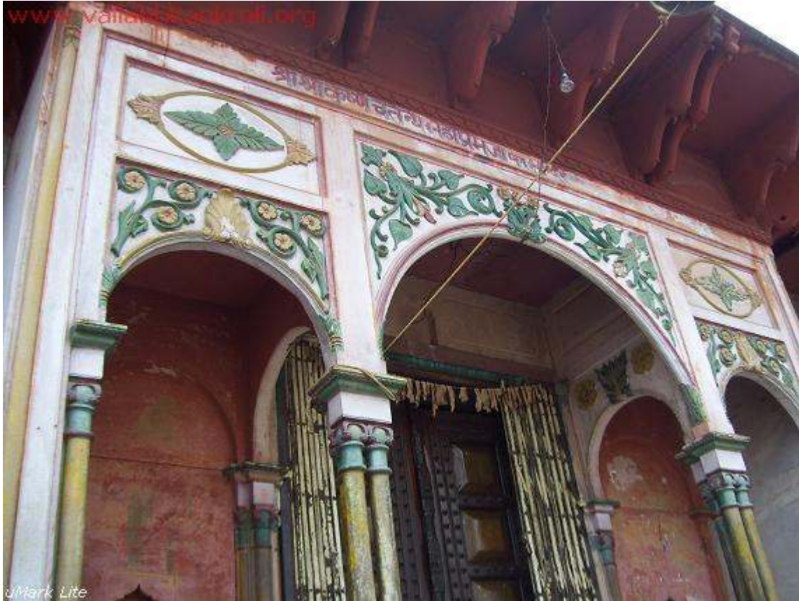
Shri Chaitanya Mahaprabhuji Mandir – Mansi ganga