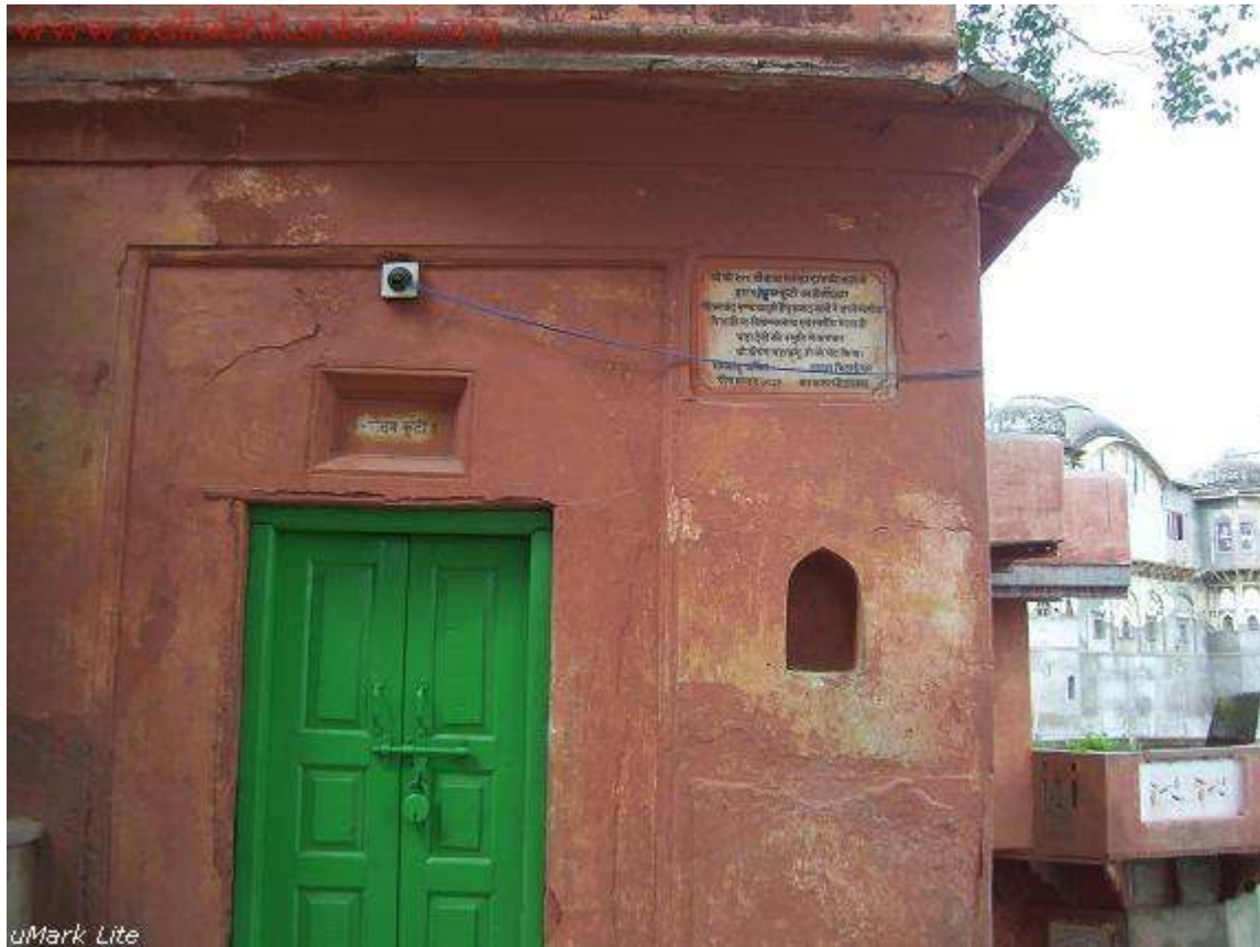
Narottam Kutir - Mansi-ganga