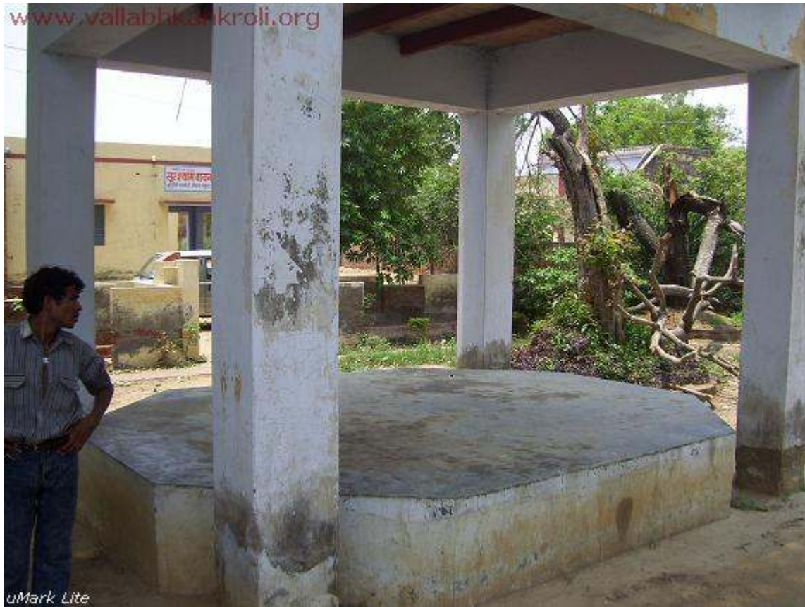
Raas Chotaro – Shri Chandrasarovar