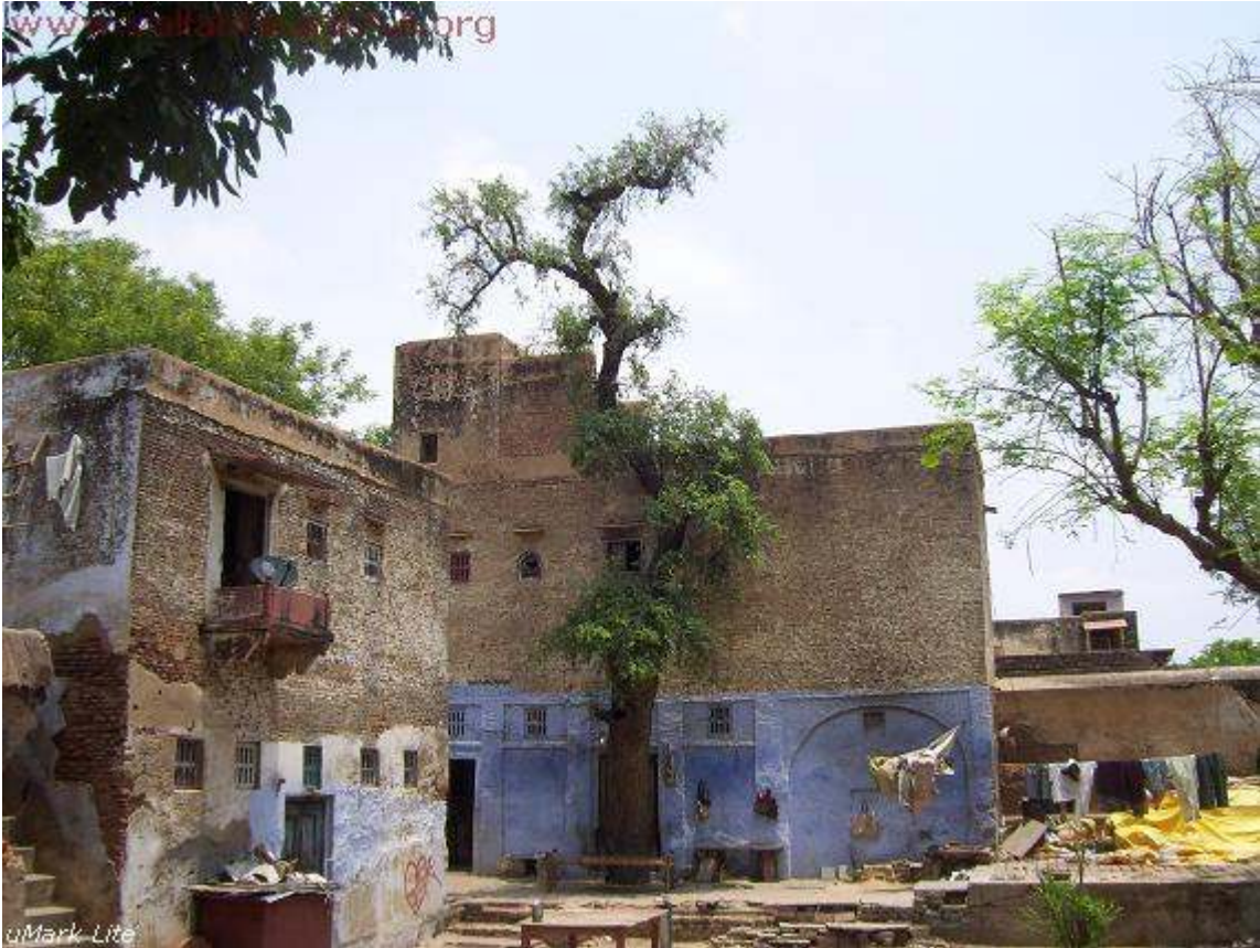
Chokar Vriksha – Shri Chandrasarovar